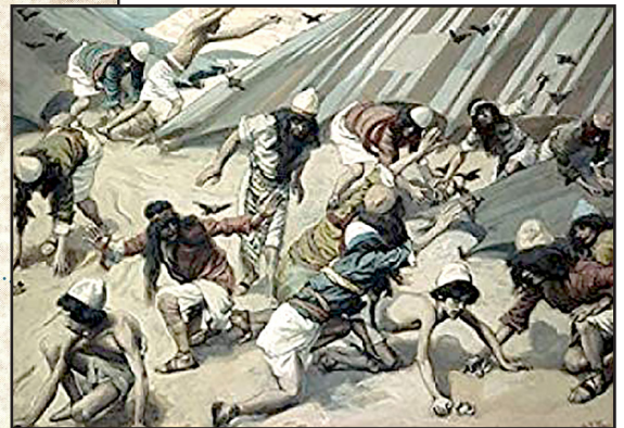
"Quails Are Sent To The Israelites" by James Tissot