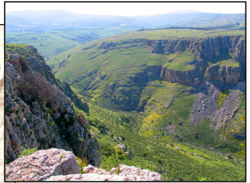
The spies traveled as far as the central highlands of Galilee ... the Promised Land