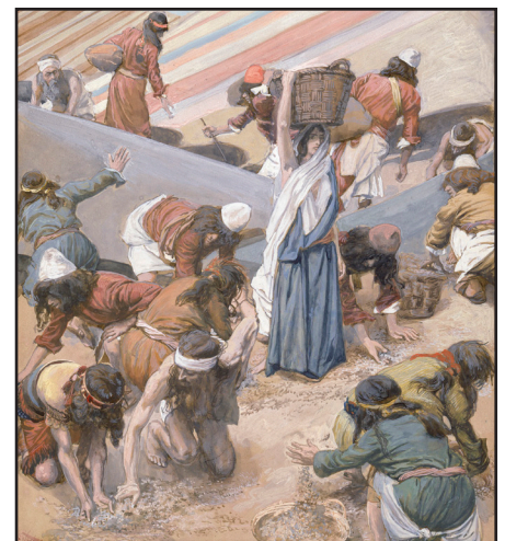
"The Gathering Of The Manna" by James Tissot