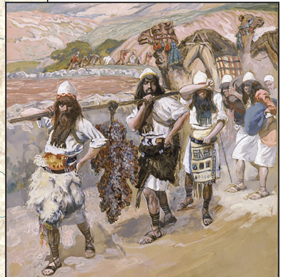
"The Grapes of Canaan" by James Tissot