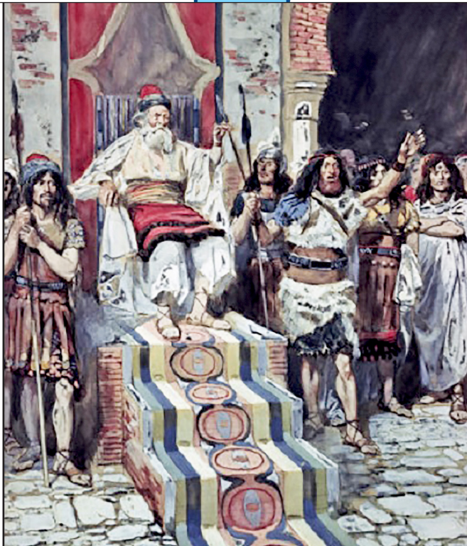
"David Sees The Messenger Arrive" by James Tissot