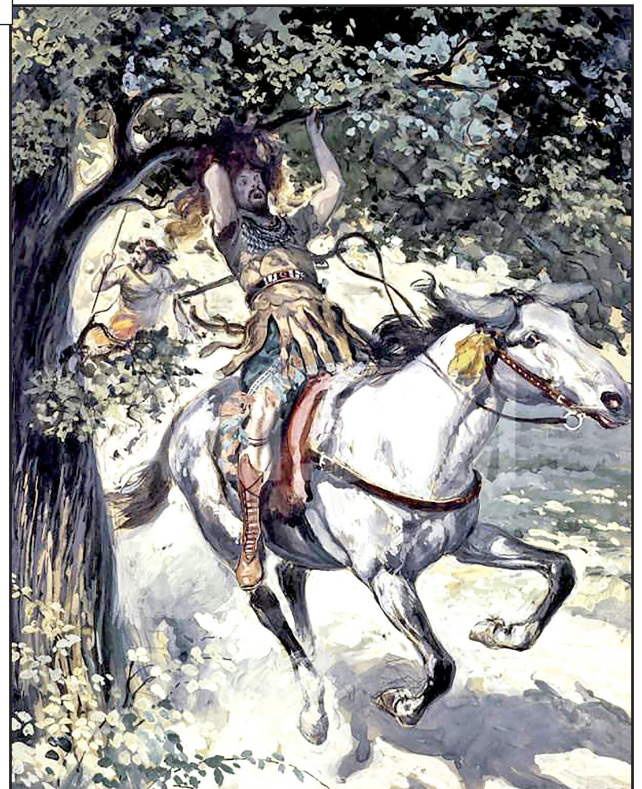
"Absalom Hanging On The Oak Tree" by James Tissot