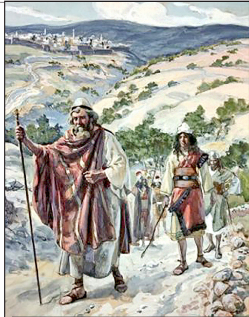
"David Quits Jerusalem" by James Tissot