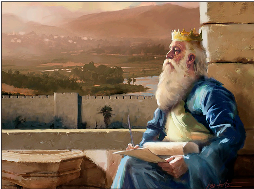
King Solomon (artist unknown)