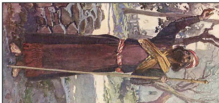
"Zechariah" by James Tissot