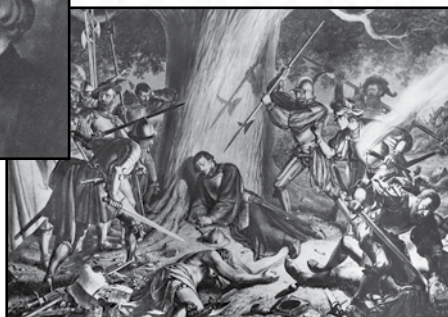
The Murder of Zwingli, 11 October 1531 by Karl Jauslin