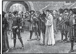
John Frith, one of Tyndale's closest friends, being led to execution for his translation and Reformation work.

The brilliant William Tyndale had more impact on the English language and culture than any other writer, and has reached more people than even Shakespeare.