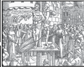
Before execution Tyndale cries out, "Lord, open the King of England's eyes!" 1563 woodcut from Foxe's Book of Martyrs.