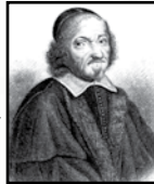
Miles Coverdale, who helped Tyndale with the NT translation.