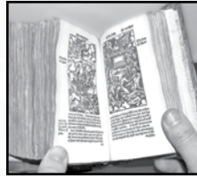
Tyndale's printed Bibles were pocket-sized, allowing for easier hiding and smuggling.